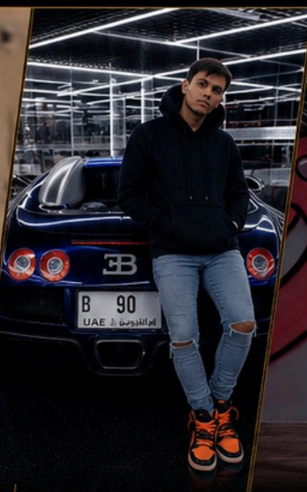
CARS &amp; AUTOMOTIVE