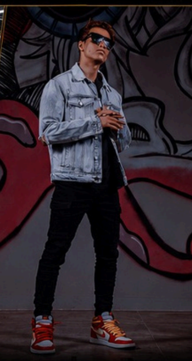
FASHION &amp; LIFESTYLE