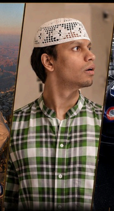
COMEDY &amp; ENTERTAINMENT