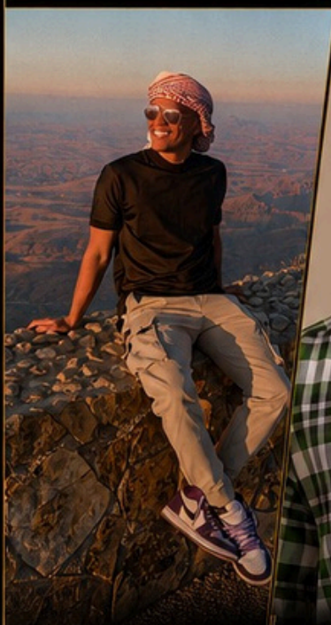
TRAVEL &amp; EXPERIENCES

Diverse content that entertains, inspires and creates meaningful connections with audiences across the globe.